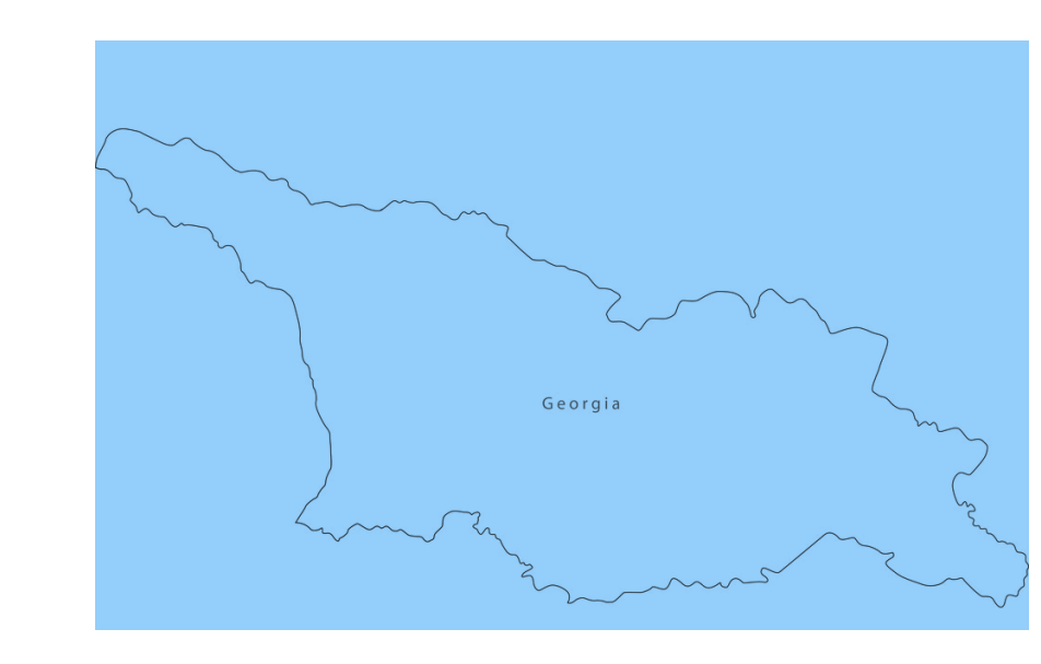
Georgia, VectorStock Free Map Image